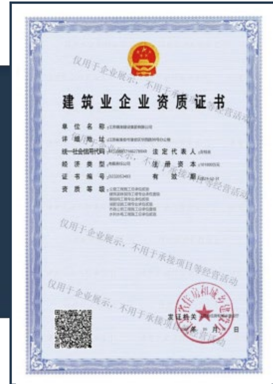
A class of construction project in construction industry A class of air defence project in construction industry