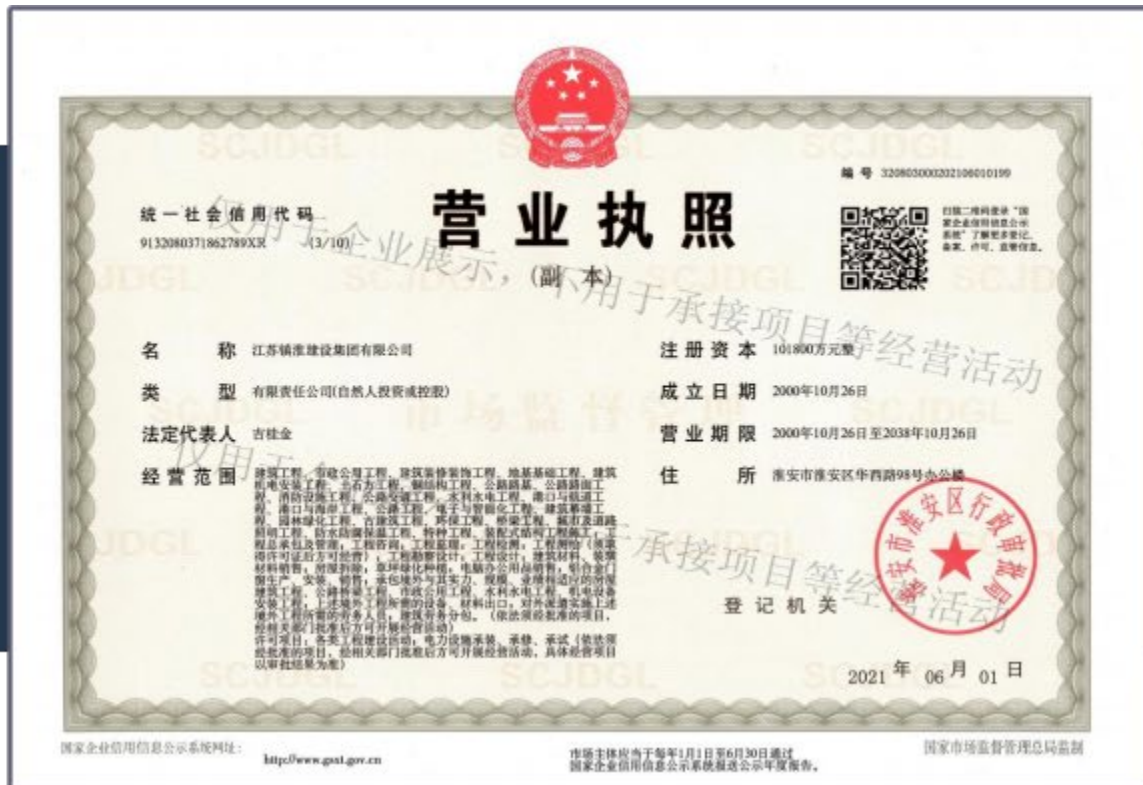
Business License Register Capital: RMB 1,018 million