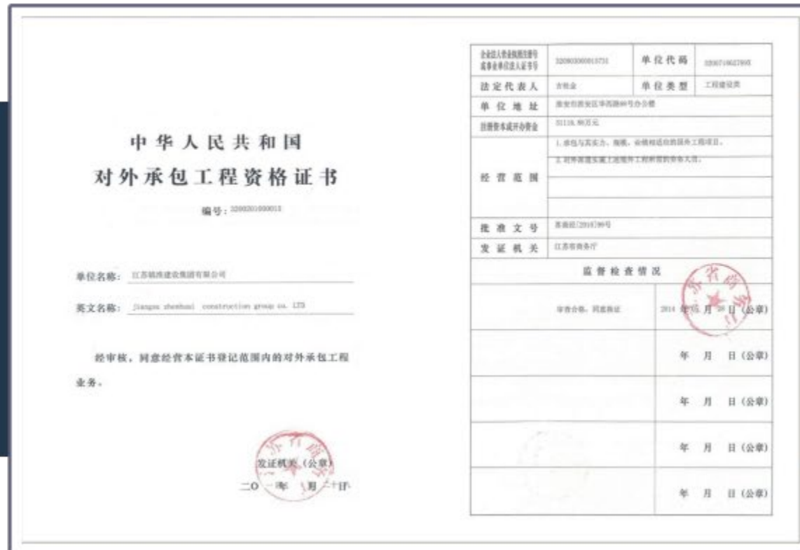
Foreign Projects Contracting Qualification Certificate of the People's Republic of China